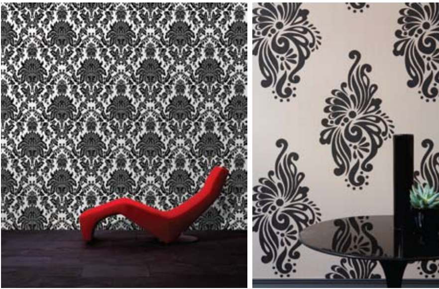
Nothing will elicit oohs and aahs like Graham & Brown Flocked Wallpapers in black and white patterns. $40/double roll, (800) 554-0887, grahambrown.com

CONTRAST Each color signifies a different extreme: while black is edgy and mysterious, white is pure and innocent.