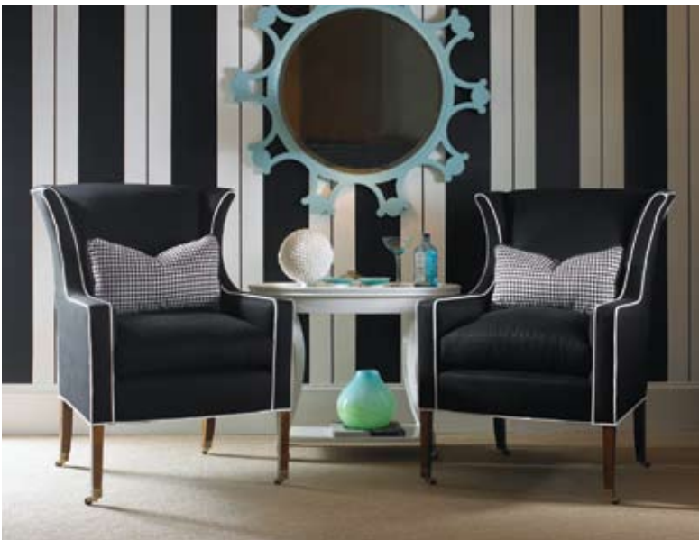
The look comes together with some classically masculine details. Tuxedo Wing Chair, $3,600, Dillard's throughout Texas, centuryfurniture.co

IMPACT black and white together create a striking impact, combining opposite ends of the color spectrum.