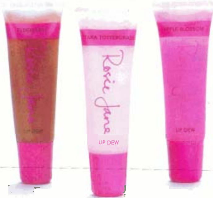
Rosie Jane cosmetics were created specifically to make daily makeup applications simple.