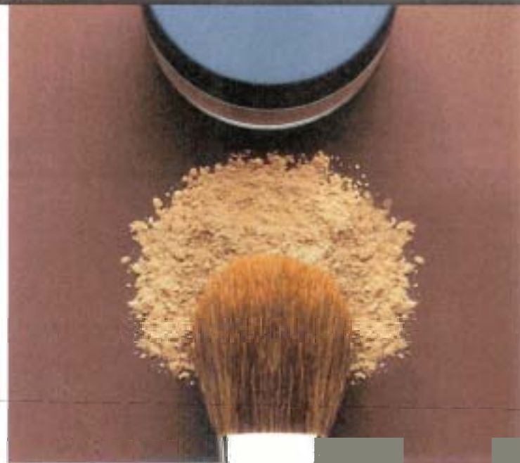
Bare Escentuals' "swirl, tap and buff" technique results in an all-day, natural looking glow.

line with excellent results. Although every product has the slight smell and taste of a good Chardonnay, we found the lipstick, lip gloss, eye shadow and lip pencil went on super smooth and imparted the ultimate in moisture, definitely erasing lines and wrinkles. 29 Cosmetics can be found at Neiman Marcus in Fashion Island.